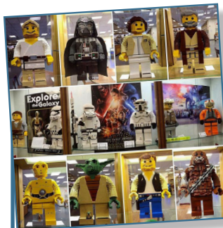
LEGO™ display, by Steve Mead, Downtown Library.

Mon MAY 1 CUÉNTAME UN CUENTO: Celebra Día del Niño con actividades de STEAM / Celebrate Children's Day with STEAM based activities at Spanish Storytime 4:30pm - 6:30pm Live Oak