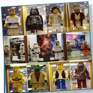
LEGO™ display, by Steve Mead, Downtown Library.

Mon MAY 1 CUÉNTAME UN CUENTO: Celebra Día del Niño con actividades de STEAM / Celebrate Children's Day with STEAM based activities at Spanish Storytime 4:30pm - 6:30pm Live Oak