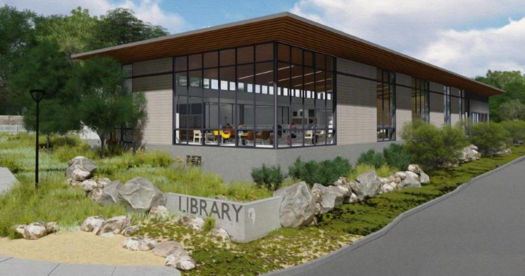
VIEW AT CORNER