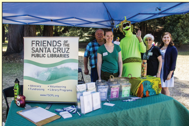
Festival of the Book

Friends consist of a volunteer Board that works on behalf of the entire library system, and individual Chapters where volunteers work on behalf of their local branch.