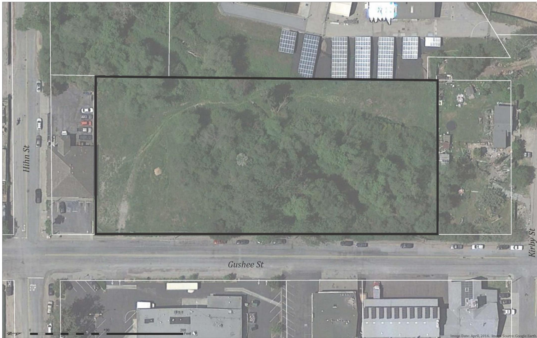
Felton Library Site

Image Date: April, 2016.